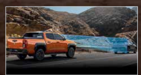
Safety for everyone